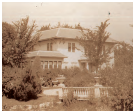
Bodus House, 1925