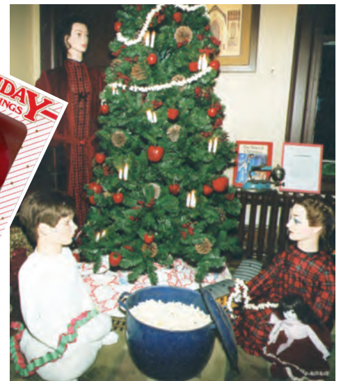
Mannequins in period costumes decorated the Christmas tree with popcorn, 2003