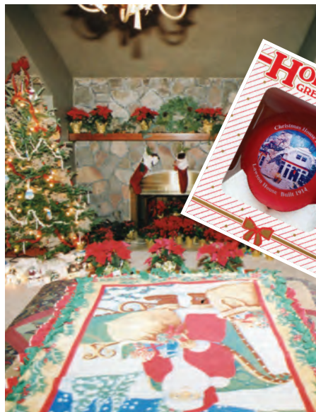
Bedroom of the Lawson House at Christmas, 2003