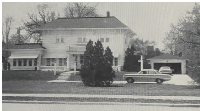
Bodus House and Garage, 1970s