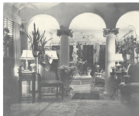
Parlor and Conservatory, 1940s