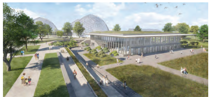
Architect's rendering of a proposed Nature Learning Center built adjacent to the Domes