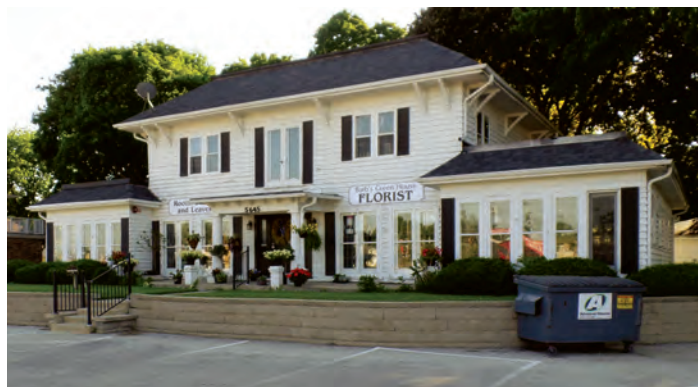
Barb's Green House Florist, 2020s