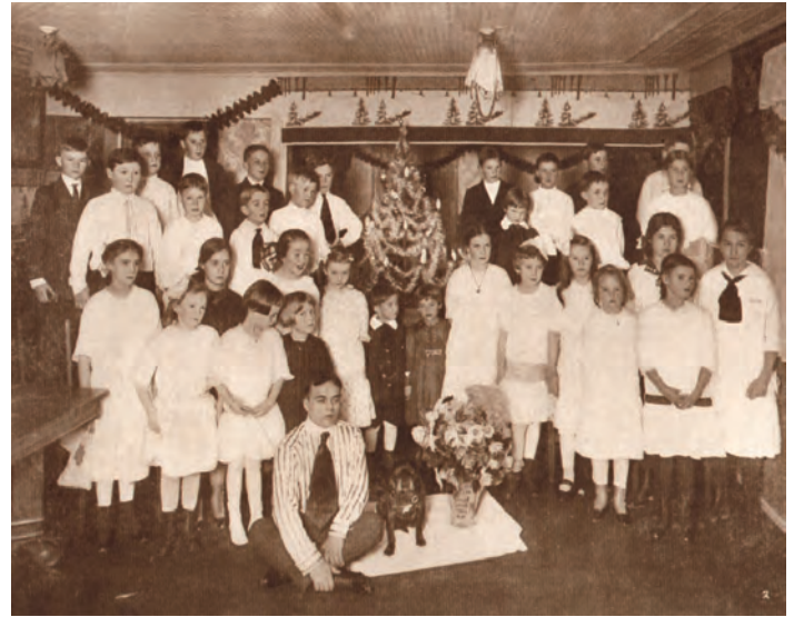
Children who attended the birthday party and Polo, the dog, 1916