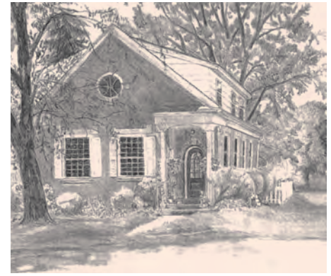
(Detail) Telephone Exchange Building - 5801 S. 109th Street