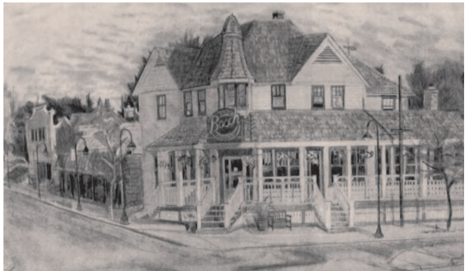
The Bosch Tavern - 5871 S. 108th Street