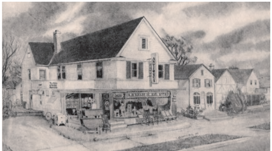
The Olde Store - 10526 W. Forest Home Avenue (Razed) Formerly Welch's Hardware Store