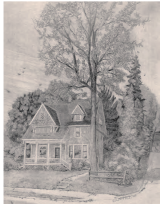
Mary Schmidt's House - 10900 W. Janesville Road (Razed)