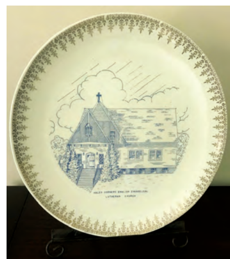
(Left) Postcard photo of the English Evangelical Lutheran Church, 1938 (Right) Commemorative plate, probably for the church's 50th anniversary