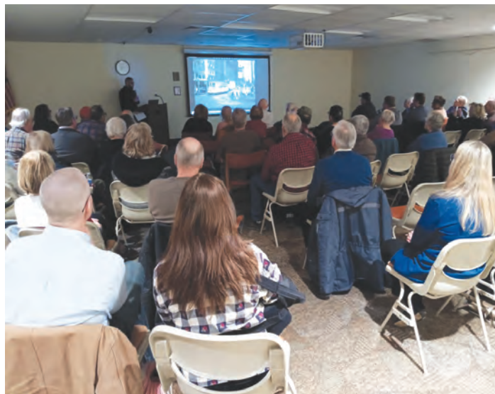
Nearly 70 people attended our first program of 2024

Bay View, and skating at Mayfair Mall's ice chalet during the 1980s – plus a variety of wedding receptions and tavern parties clearly showing that previous generations certainly knew how to "party hearty!"