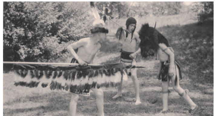
Boys in costume practicing their dances, 1957