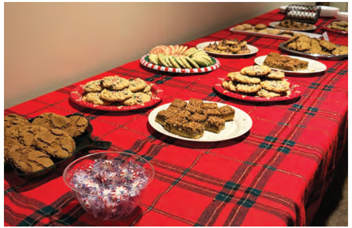
Holiday treats enticed audience members.