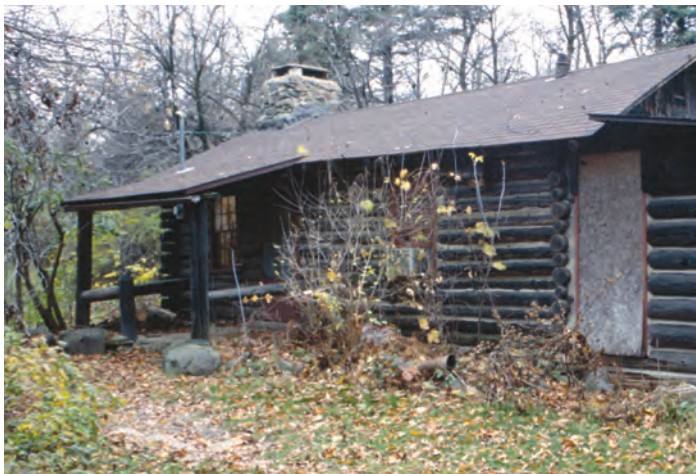
This 1986 photo shows the rough condition the Ben Hunt Cabin was in.

In September 1985, the Cabin was purchased and plans were made for moving it. After delays because of bad weather, the Cabin was moved to the Library grounds in February 1986.