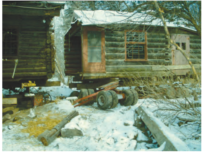
The two pieces of the Cabin were lined up at their final location before being reconnected in Spring 1987.