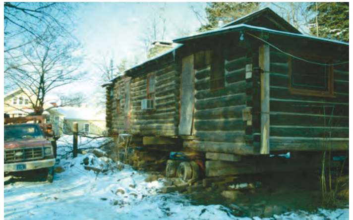
With considerable effort, the Cabin was lifted onto the trailer that would transport it to its new location.