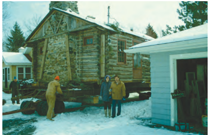
With just inches to spare, the Cabin was eased out from the back yard.