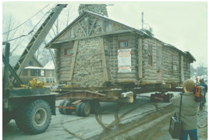
Next, the Cabin made slow progress as it was towed along Janesville Road.