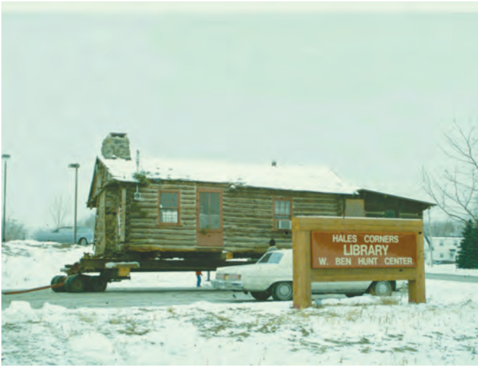
The Cabin was temporarily left in place after arrival in the parking lot of the Hales Corners Library.