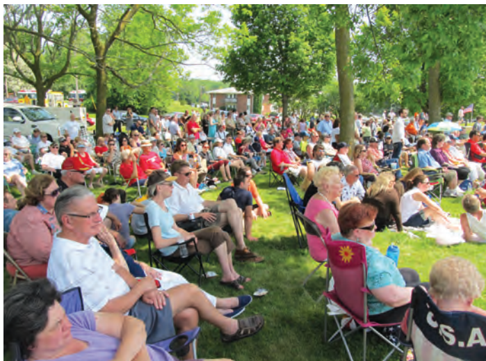
Veterans Memorial Dedication, 2012