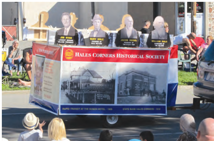
HCHS float in Fourth of July Parade, 2014