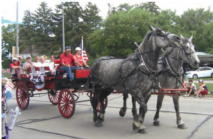
Trustees' carriage in Fourth of July Parade, 2010