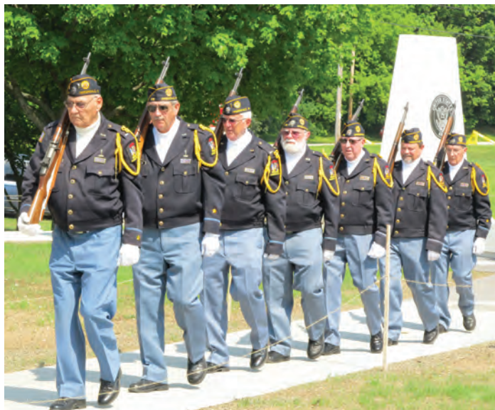
Veterans Memorial Dedication, 2012