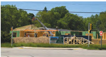
New office building at intersection of Forest Home and Grange Avenues, former site of Petroff's Drive-In

Hales Corners, for good or bad, has been undergoing months and months of road construction projects along Highway 100. It's also experiencing noteworthy new construction and building upgrades—history in the making!