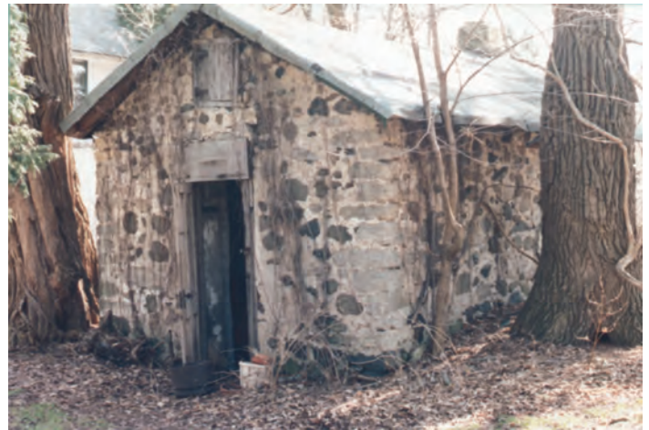
Seneca Hale's Summer Kitchen before the move in 1995

The display should be okay for the next 20 years or so.