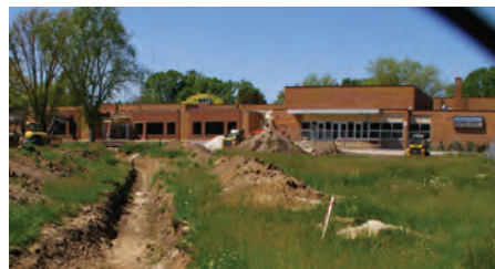
New addition to Hales Corners Elementary School on Janesville Rd.