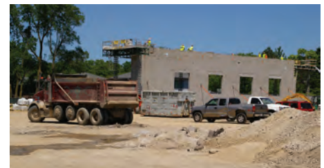
New Festival Foods on Highway 100, former site of K-Mart