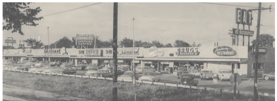
Hales Corners Shopping Center in 1955