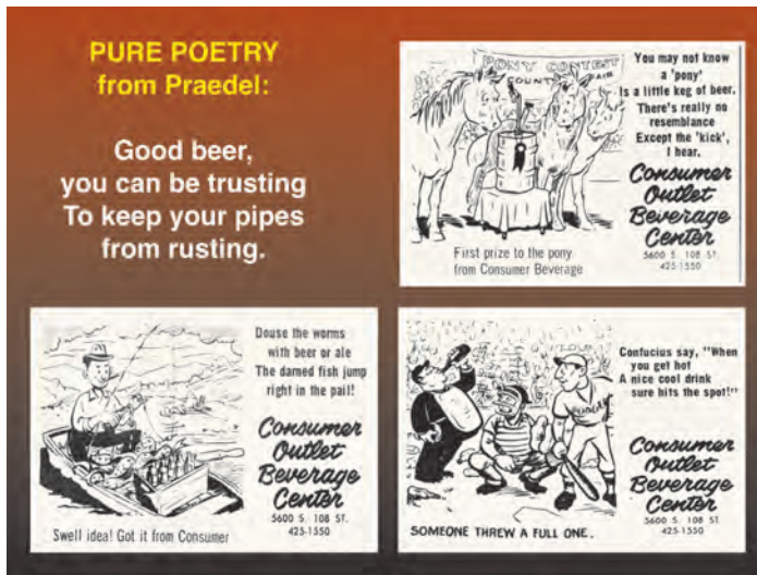
Slide from program featuring Consumer Outlet Beverage Center ads from the 1970s