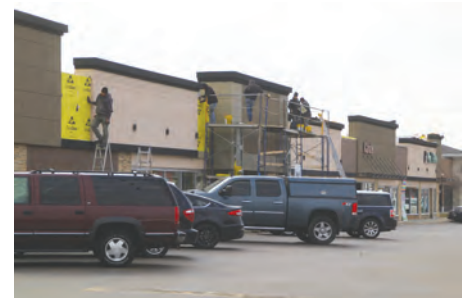
The "Facelift" in progress

the Village's retail scene and an important part of our history.